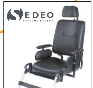
Sedeo seating system