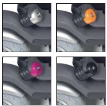
Various colour accents

Due to its modular design, Alex can be fully adjusted to the specific requirements of the user. Full range of electrical options and special controls are available.