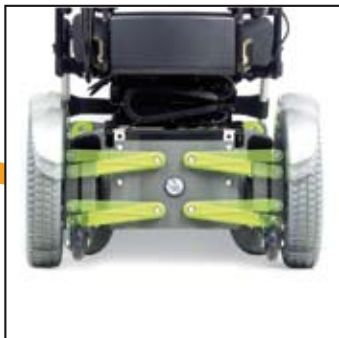
Unique suspension system